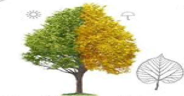
Small leaved Lime