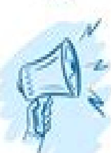
Article 10 The right to freedom of expression