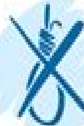
Article 1, Protocol 13 Abolition of the death penalty