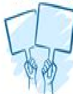
Article 11 The right to freedom of assembly and association