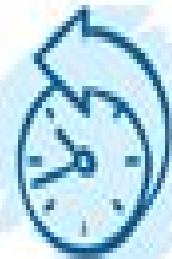
Article 7 The right not to be punished for something that wasn't against the law when you did it