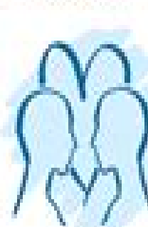
Article 12 The right to marry and start a family