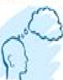
Article 9 The right to freedom of thought, conscience and religion