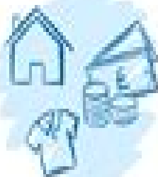
Article 1, Protocol 1 The right to peaceful enjoyment of possessions