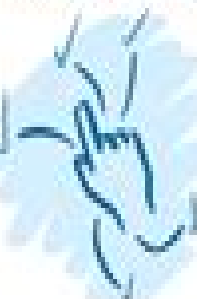
Article 8 The right to respect for private and family life, home and correspondence