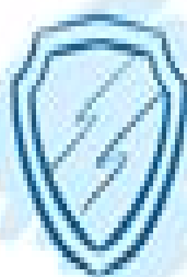
Article 3 The right to be free from torture and inhuman or degrading treatment