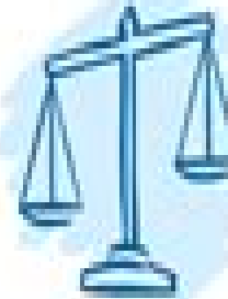
Article 6 The right to a fair trial