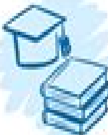
Article 2, Protocol 1 The right to education