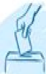
Article 3, Protocol 1 The right to free elections