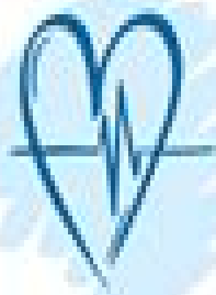
Article 2 The right to life