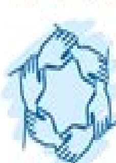
Article 14 The right to be free from discrimination