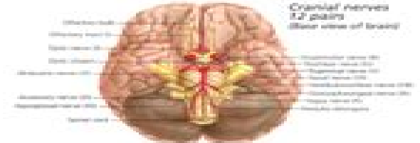
Cranial nerves 12 pairs (Base view of brain)

Synaptic connections are the points where two neurons meet and communicate. They are responsible for transmitting information from one neuron to another.