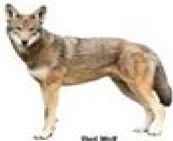
Red Wolf Canis rufus , 80