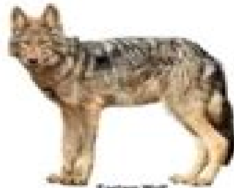
Eastern Wolf Canis lycaon , 82