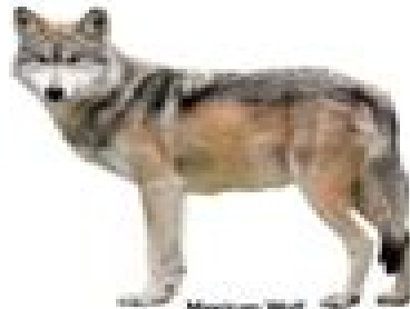
Mexican Wolf Canis lupus baileyi , 86