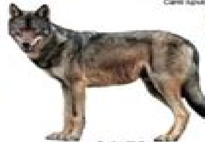
Bushman Wolf Canis lupus signatus , 88