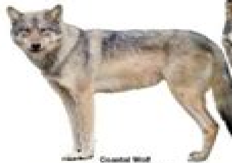
Coastal Wolf Canis lupus alpinus , 82