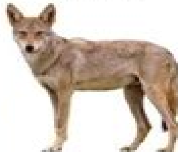
Persian and Indian Wolf Canis lupus pallipes , 104