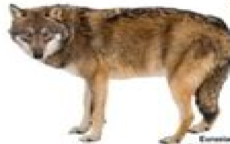
European Wolf Canis lupus lupus , 84