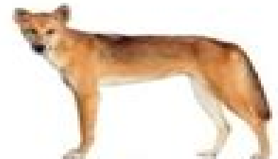
Dingo Canis lupus dingo , 108