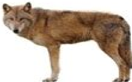
Tibetan and Himalayan Wolf Canis lupus chanco , 102