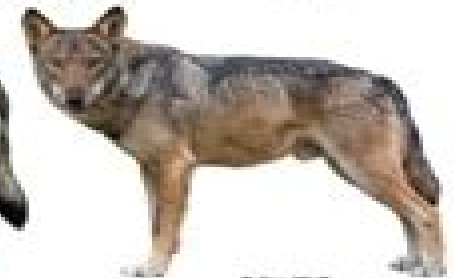
Italian Wolf Canis lupus italicus , 100