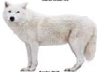
Arctic Wolf Canis lupus arcticus , 84