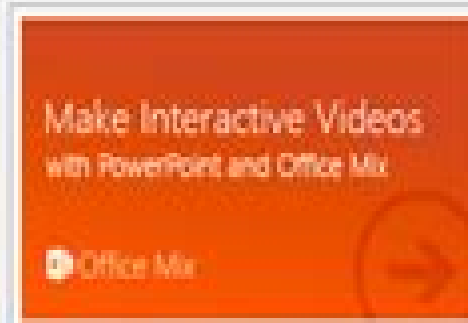
Create an Office Mix