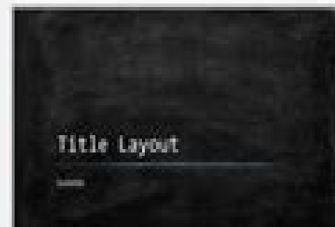
Chalkboard education presentati...