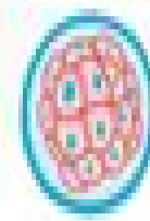
16- CELL STAGE