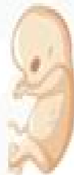
FOETUS (20 WEEKS)