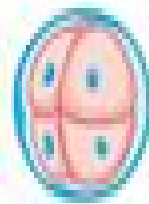
4- CELL STAGE