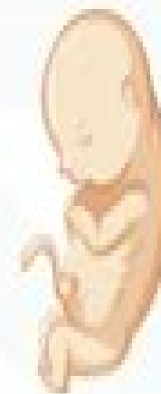
FOETUS (40 WEEKS)