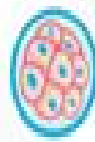
8- CELL STAGE