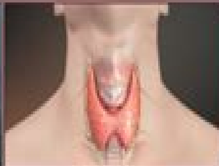
Thyroiditis Hashimoto's Disease Graves Disease