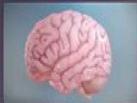
Multiple Sclerosis Guillain-Barre Syndrome