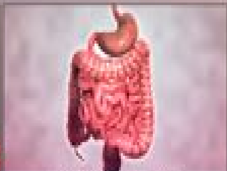
Celiac's Disease Crohn's Disease Ulcerative Colitis Type 1 Diabetes