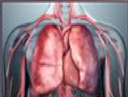
Fibromyalgia Wegner's Granulomatosis