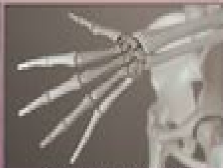
Rheumatoid Arthritis Ankylosing Spondylitis Polymyalgia Rheumatica