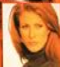
ANGIE EVERHART Last Action Hero