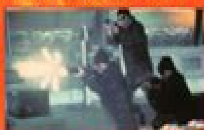
MICHAEL MADSEN Révillon Dots