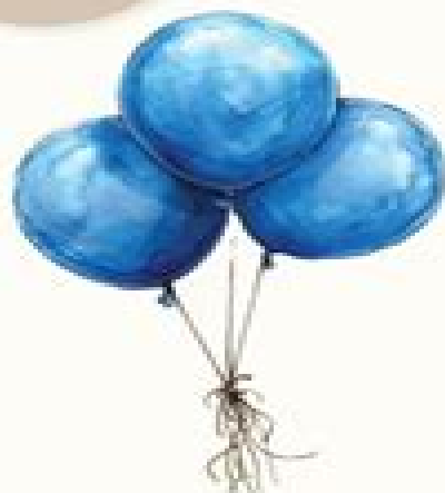
tres globos/ vejigas azules three blue balloons