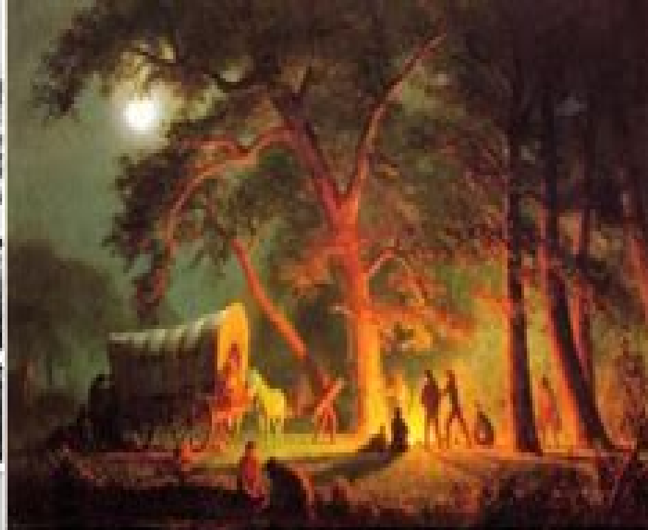
Oklahoma and Indian Territories