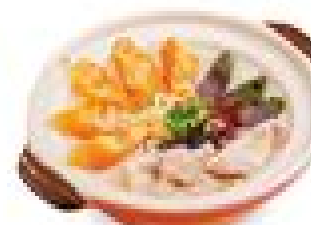
P06 猪骨焗肉粥 RM 12.90 Charcoal Egg & Pork Porridge