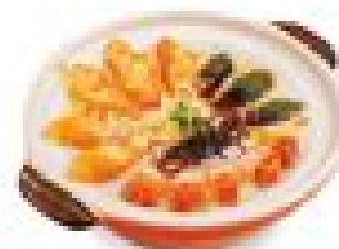
P01 火腿焗肉粥 RM 12.90 Roasted Pork with Cornmeal Egg Porridge