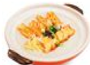
P03 鸡骨粥 RM 12.90 Chicken Bone Porridge