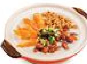
P04 肉碎焗肉粥 RM 12.90 Minced Meat with Broken Egg Porridge