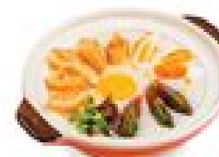
P05 猪骨粥 RM 12.90 Signature Pork Bone with Egg Porridge