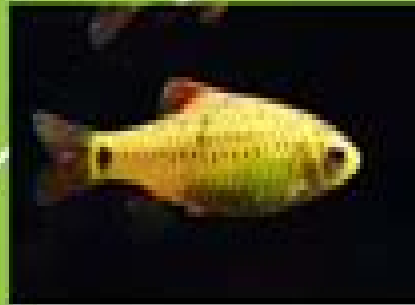
2. GOLDEN DWARF BARB