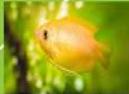
6. GOLDEN GOURAMI