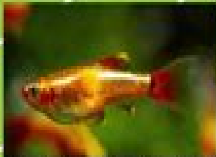
4. GOLDEN WHITE CLOUD MOUNTAIN MINNOW