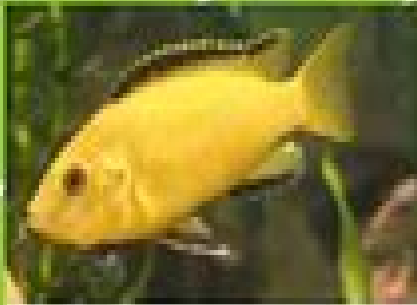
1. ELECTRIC YELLOW CICHLID