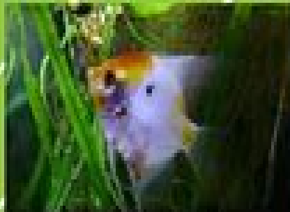
5. GOLD ANGELFISH