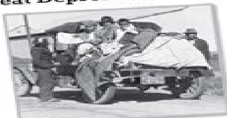
A family looking for work, 1935

Sharecroppers were farmers who worked someone else's land and gave up some of the harvest. My father