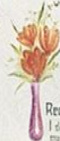
Red Tulip. I declare my love.