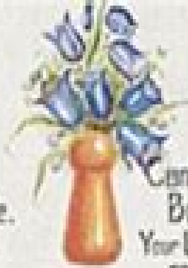
Canterbury Bell. Your letter received.