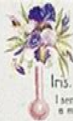
Iris. I send a message.