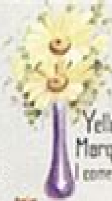
Yellow Marigold. I come again.