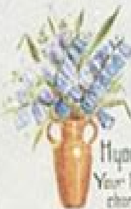
Hypocissus. Your loveliness charms me.