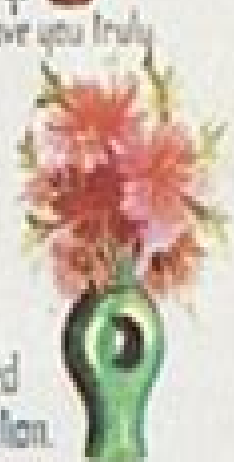
Red Carnation. My heart aches for you.