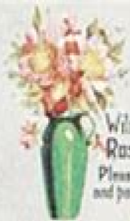
Wild Rose. Pleasure and pain.