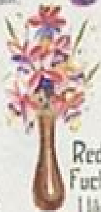
Red Fuchsia. I like your taste.