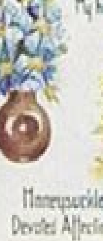
Honeysuckle. Devoted Affection.