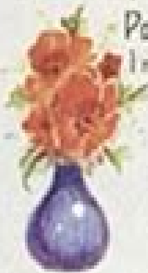
Poppy. I am not free.