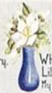
White Lily. My love is pure.