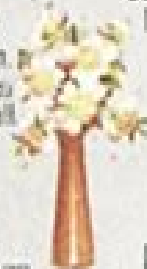
Apple Blossom. I prefer you before all.