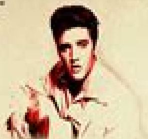
TABELA PERIÓDICA DO ROCK N' ROLL