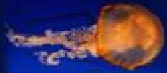
Pacific Sea Nettle