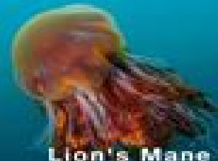
Lion's Mane Jellyfish