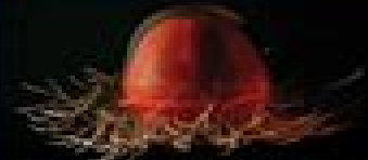
Big Red Jellyfish