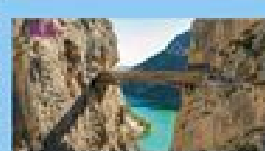
Hiking Camino del Rey and El Torcal