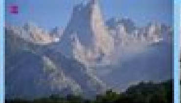
Hiking in Pico de Europa National Park