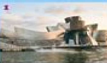
Bilbao: Visit the Guggenheim Museum Bilbao and parks