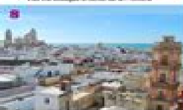
Views and Terraces de camaroneras in Cádiz