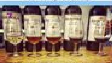
Visit the vineyards of Jerez de la Frontera