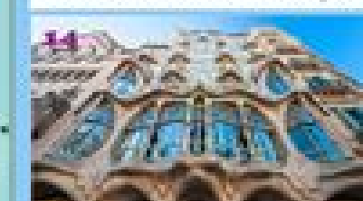
Gaudi and architecture in Barcelona