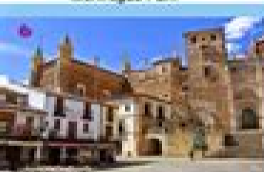
The town of Trujillo and Cuatrecasas