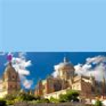
Following the Stone Route and visiting the UNESCO World Heritage sites of Salamanca, Cáceres and Mérida