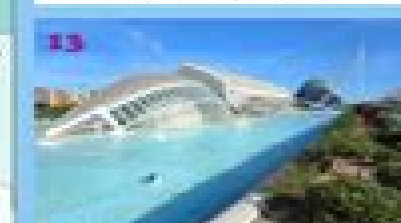
Valencia with Turia Park and modern architecture