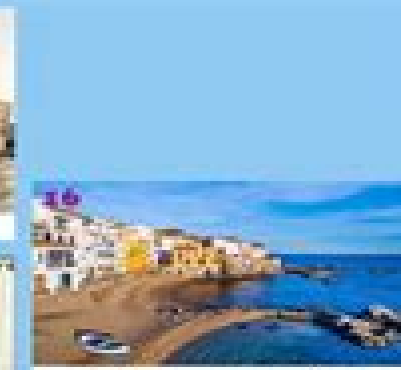
Terraces: the prehistoric village on the Costa Brava