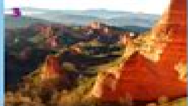
Visit the Las Medulas Roman gold mines