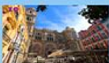
Take a route tour of Malaga