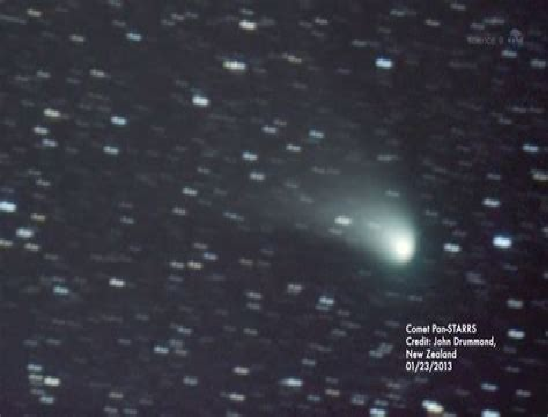
Comet Pan-STARRS 01/23/2013