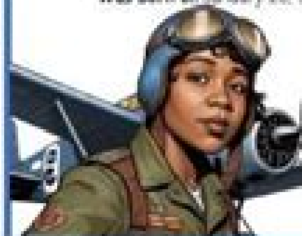
Bessie Coleman: Was born on January 26, 1892

SHE WAS THE FIRST AFRICAN-AMERICAN WOMAN TO HOLD A PILOT'S LICENSE. COLEMAN OVERCAME RACIAL AND GENDER BARRIERS IN AVIATION DURING THE EARLY 20TH CENTURY AND BECAME A CELEBRATED FIGURE IN THE FIELD OF AVIATION.