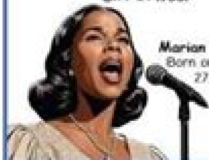
Marian Anderson: Born on February 27, 1897

SHE WAS AN AFRICAN-AMERICAN CONTRALTO AND ONE OF THE MOST CELEBRATED SINGERS OF THE 20TH CENTURY. SHE BROKE RACIAL BARRIERS BY BECOMING THE FIRST AFRICAN-AMERICAN TO PERFORM AT THE METROPOLITAN OPERA IN NEW YORK CITY IN 1955.