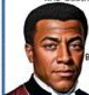
Benjamin Banneker: Born on November 9, 1731

HE WAS A FREE AFRICAN-AMERICAN ASTRONOMER, MATHEMATICIAN, AND SURVEYOR. BANNEKER IS KNOWN FOR ASSISTING IN THE SURVEYING OF WASHINGTON, D.C., AND FOR PUBLISHING SEVERAL ALMANACS CONTAINING HIS CALCULATIONS AND OBSERVATIONS.