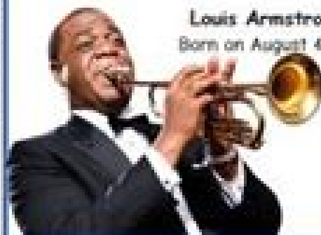
Louis Armstrong: Born on August 4, 1901

HE WAS A JAZZ TRUMPETER, COMPOSER, AND SINGER. ARMSTRONG WAS A FOUNDATIONAL INFLUENCE IN JAZZ AND POPULAR MUSIC, KNOWN FOR HIS DISTINCTIVE VOICE AND IMPROVISATIONAL SKILLS.