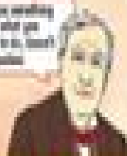
Edison of Thomas Edison

Just because something doesn't do what you planned it to do, doesn't mean it's useless.