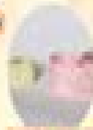
Punched paper tape

Soon, Thomas made his first invention which was paper tape punched with holes to send messages more quickly.