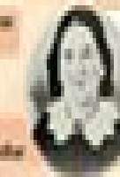
Thomas Edison's mother