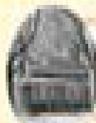
The house where Thomas Edison was born

Thomas Alva Edison was born on 11 February 1847 in a house called Milan in Ohio which is in the United States of America.