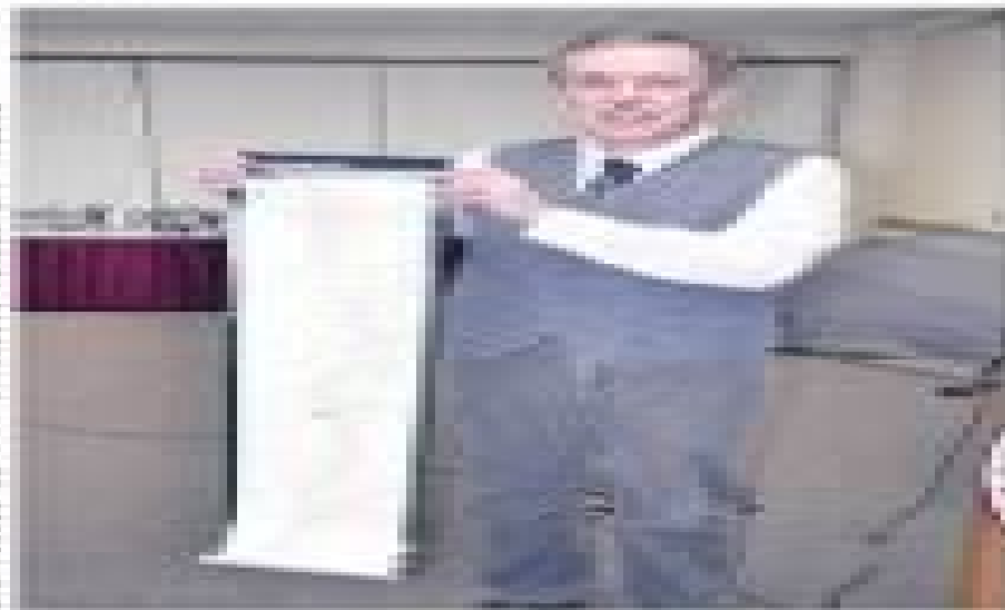
The man is holding a large white banner or map.