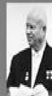
Nikita Khrushchev First Secretary