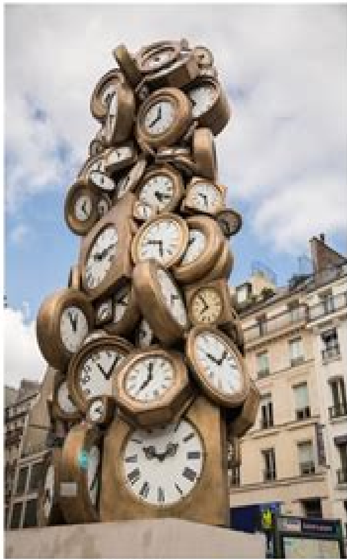
« L'Heure de Tous » Jaume Plensa Cour du Havre - Gare Saint-Lazare Paris Un Guide à Paris - Valéry Hugotte