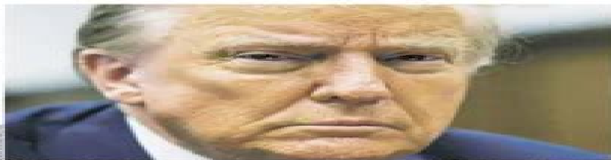
Former President Donald Trump's court hearing on his criminal trial got under way with both sides opening statements.

Prosecutors say the late Reagan administration defense lawyer paid off a hush-money witness.