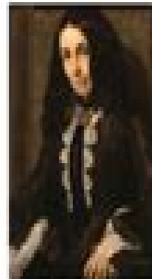
Elizabeth Barrett Browning