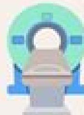
Magnetic resonance imaging