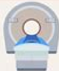
Positron emission tomography