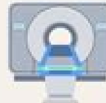
X-ray computed tomography