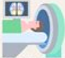
Single-photon emission computed tomography