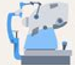
Optical coherence tomography