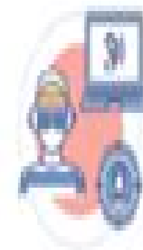
Wiretapping or eavesdropping