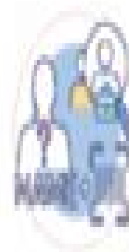
Hiring away employees