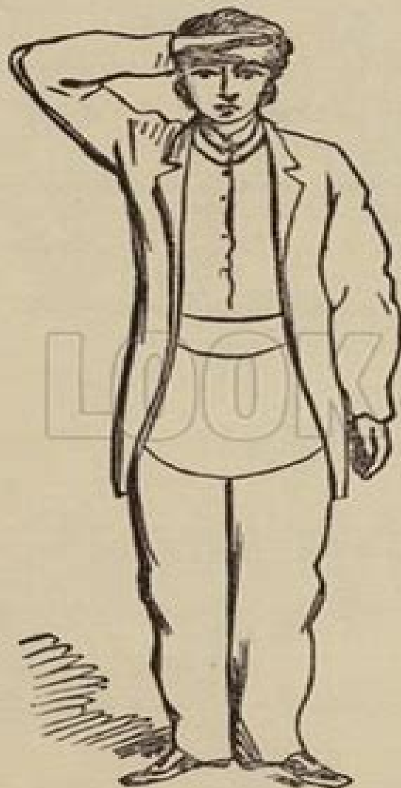
ROYAL ARCH DUEGARD AND SIGN.