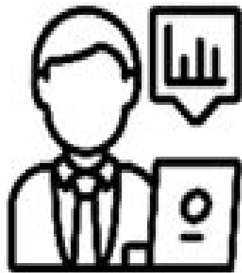
Fixed Income Analyst or Manager