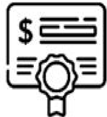
Fixed Income Securities Like Bonds, Treasuries, Debt Instruments