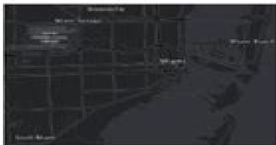
Human Geography Dark Map