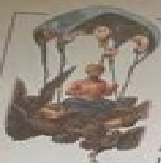
EAGLE POWER Fleagle had long known that a little more than human power was needed to fly.