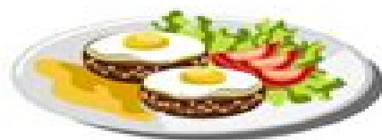
BEEFSTEAK WITH EGG