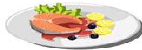
SALMON WITH LEMON