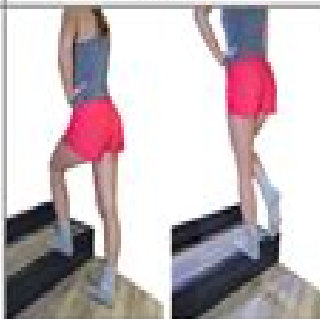
Stair Step Ups