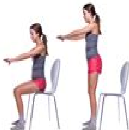
Up and Downs