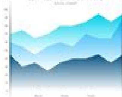
EDITABLE AREA INFOGRAPHIC