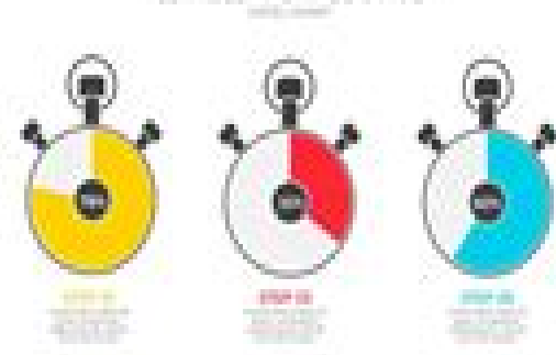
EDITABLE TIME INFOGRAPHIC