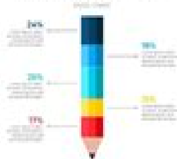
EDITABLE PENCIL INFOGRAPHIC