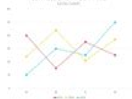
EDITABLE LINE INFOGRAPHIC