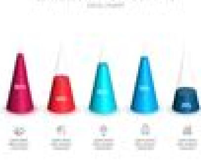
EDITABLE PYRAMID INFOGRAPHIC