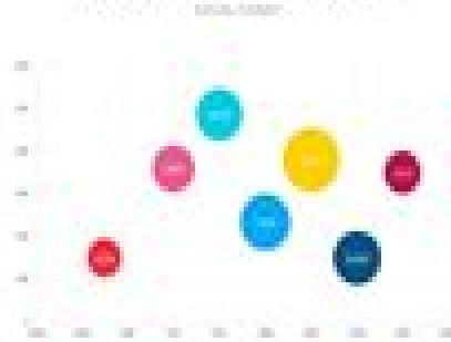
EDITABLE BUBBLE INFOGRAPHIC