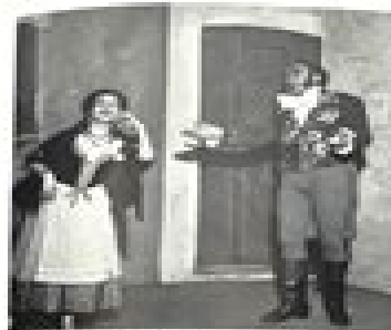
“Yes, I am ready with love to surrender him!” Agnes is delighted with Mr. Whitmore's plan, the young man, Prospero, and gladly agrees to withdraw the matter from the press.

poet PASCAGLIE. Genius opens in three acts, with music and libretto by Giovanni Ruffini. For long time the most thoroughly physical of Italian comic opera was The Triumph of the Plebeians , but it has recently been displaced by Don Pascaglio , which is now considered by the critics as the most characteristic of the work. The comicable scenes have a satirical character, which seems to characterize comic opera; and it contains many otherwise solidities. It is a typical 18th-century comedy of manners, satirical in construction and plot, and to be read with vivacity. Elements