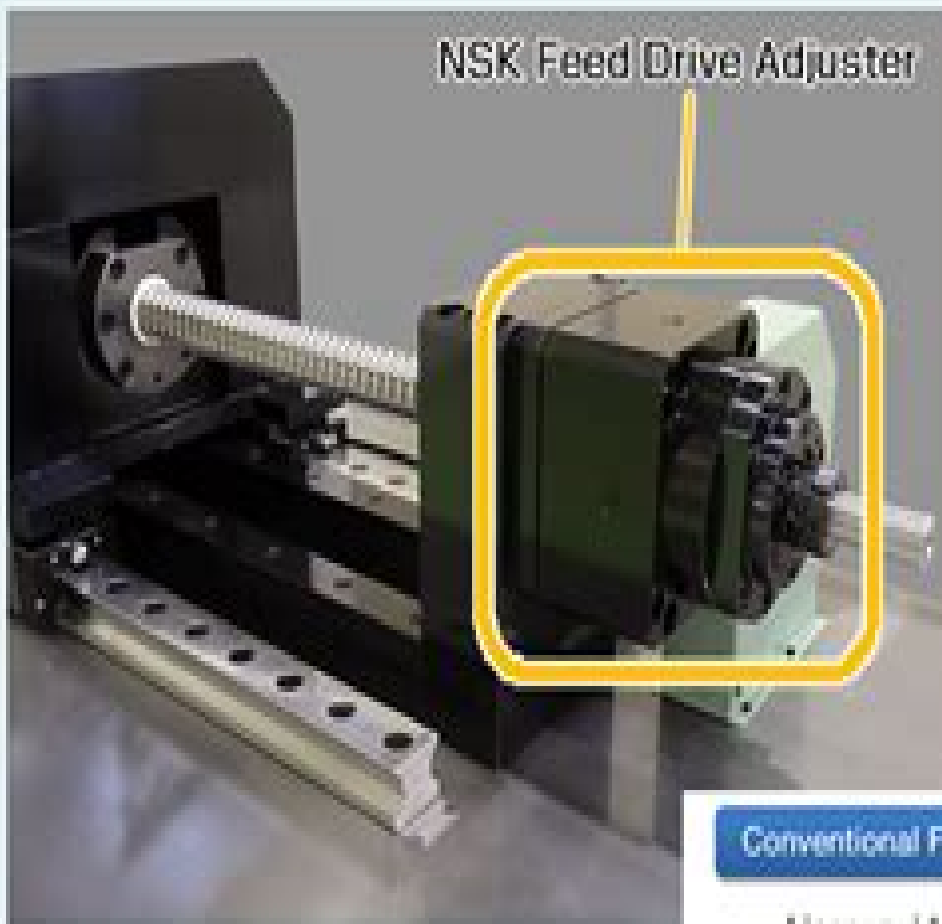
NSK Feed Drive Adjuster