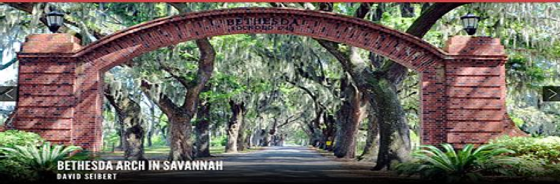
BETHESDA ARCH IN SAVANNAH