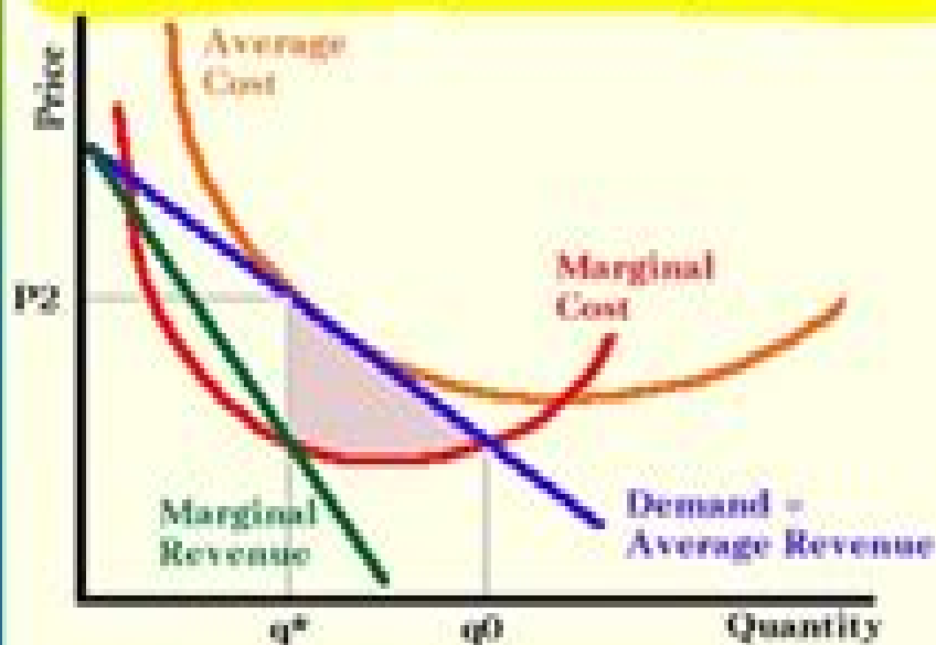
The model of monopolistic competition