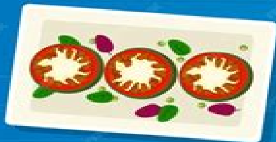
GRILLED VEGETABLES WITH CHEESE