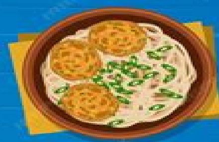
SPAGHETTI WITH KEFTEDES