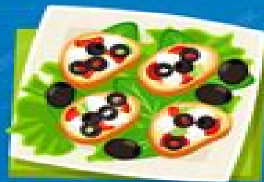
TOMATO AND FETA CROSTINI