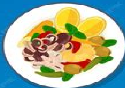
OCTOPUS SALAD HTAPODI XIDATO