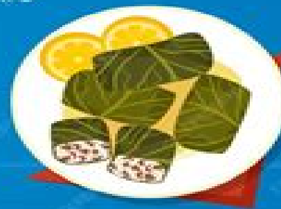
STUFFED GRAPE LEAVES WITH MEAT DOLMAS