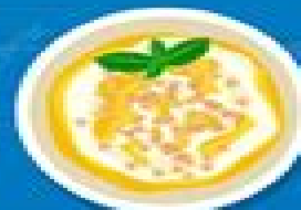
YOGURT HONEY DESSERT WITH WALNUTS