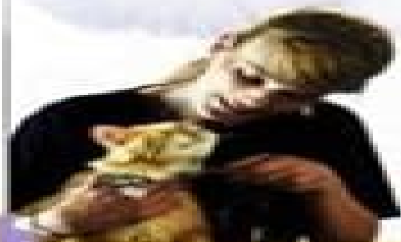
training on a lead