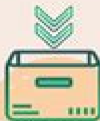
Drop box for Book Returns