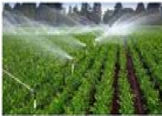
Water Resources Management