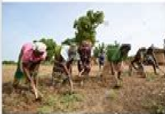
Agricultural Production Processes