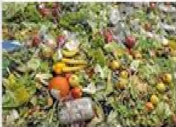
Food Waste Control