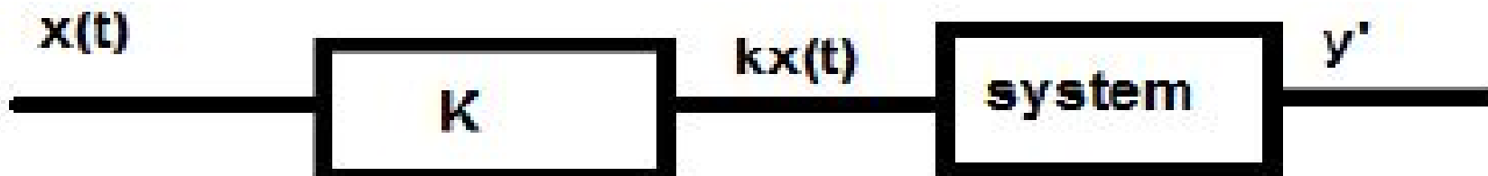
Law of homogeneity