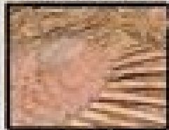
SKIN CLOSE UP.