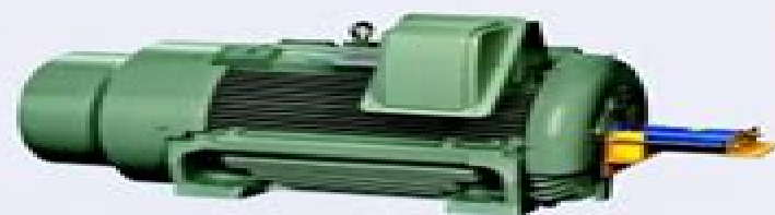
Premium Efficiency Big Motor (Global Series)