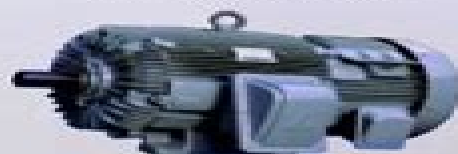
Slip Ring (Wound Rotor) Motor