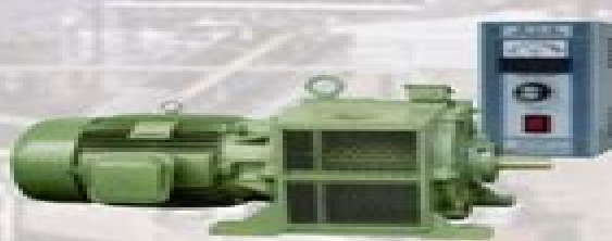
Eddy Current Motor