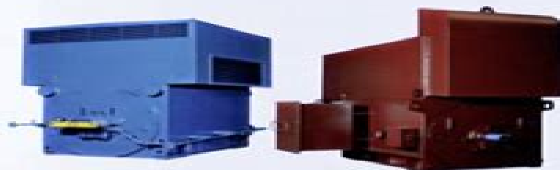
Low Voltage and High voltage Big Motor