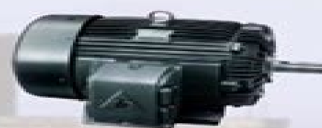
Explosion Proof Motor (UL Listed)