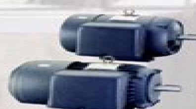
Single Phase Motor