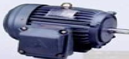
Increased Safety Motor