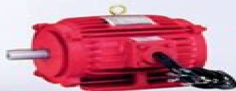
Smoke Spill Motor (High Temperature Resistant Motor up to 400 degree C for 2 hours)