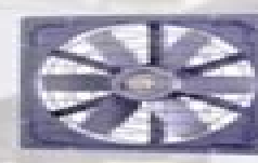
Industrial Ventilation Fan