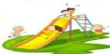
play in the park