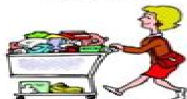
do the shopping