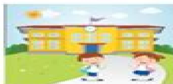
go to school