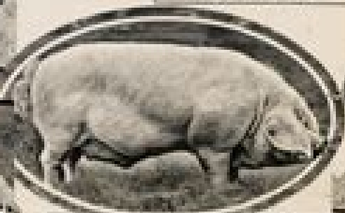
LONG WHITE LOPPED