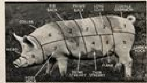
Illustration of an Improved Suffolk Hog, showing the characteristic large, rounded body and prominent snout.

MODERN BACONER: These animals are selected as the best for the purpose of producing a large quantity of high quality pork. They are the result of careful selection and breeding.