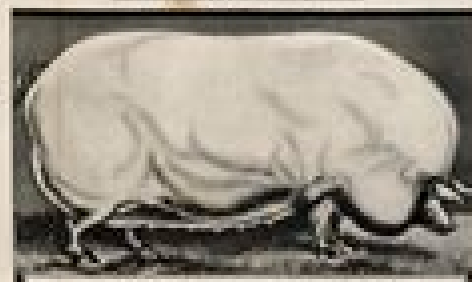
IMPROVED SUFFOLK HOG

Illustration of an Eastern Hog, showing the characteristic large, rounded body and prominent snout.