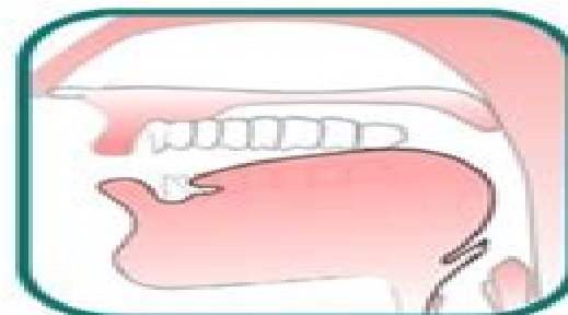
/ɒ/ - short 'o'