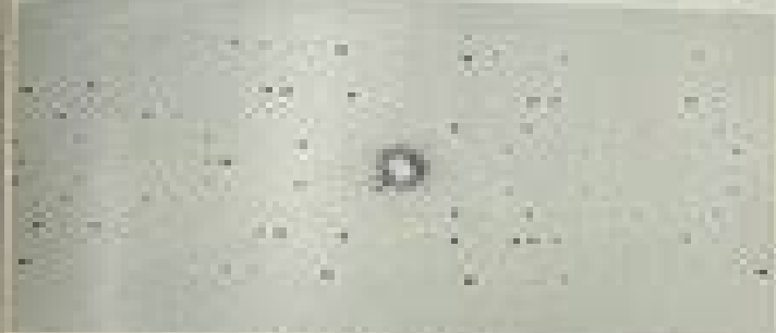
FIG. 11. DISTRIBUTION OF MATTER IN THE SOLAR SYSTEM

THE DISTRIBUTION OF MATTER IN THE SOLAR SYSTEM IS SUCH THAT THE SUN CONTAINS 99.8 PER CENT OF THE TOTAL MASS, THE PLANETS 0.2 PER CENT, AND THE PLANETARIES 0.002 PER CENT.