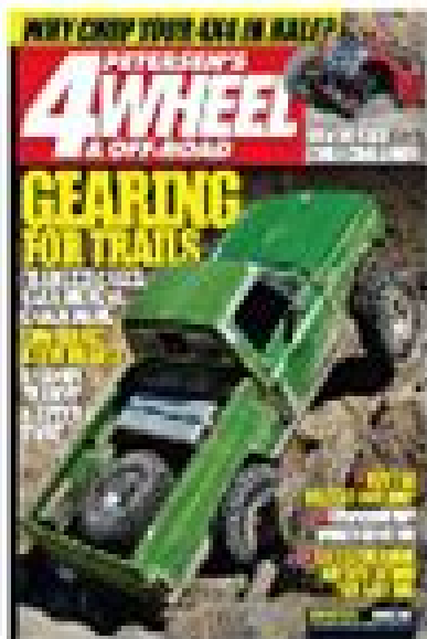
4Wheel & Off-Road